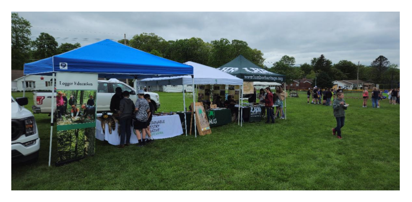
PA SIC partnered with the Moshannon State Forest, and displayed along side the Allegheny Hardwood Utilization Group and the Lumber Heritage Region.

this event and share our perspective on the importance of sustainable forest management in Pennsylvania. We used furs generously donated to the SIC last year by the PA Trappers Association to talk with students about how forest management benefits Pennsylvania wildlife, and large prints of the Alleghany National Forest's famous Arnot photo study to show how a forest grows after being harvested. Along side our table were partners from DCNR Forestry's Moshannon State Forest, AHUG, and the Lumber Heritage Region.