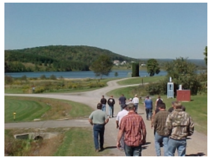
At the Wellsboro BOF Office, a group of participants in Environmental Logging training heads for the hills to develop an Erosion and Sedimentation (E&S) Plan to cover an imaginary timber harvest.

Minnesota has adopted one of the country's most aggressive Renewable Portfolio Standards, with a mandate for utilities to produce 25% of their power from non-fossil sources by 2025, so extractions from the state's carbon base for the export market are of concern to diverse interests.