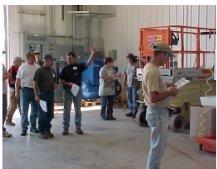
Participants in Garage Safety training do a walk through of the garage looking for anything that may pose a hazard. This particular training helps to identify potential problems before they cause injuries - or worse.