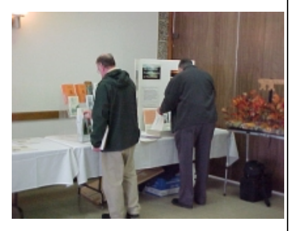
Forest landowners take advantage of the multitude of printed materials available through the PA SFI program to help them manage their forest lands.