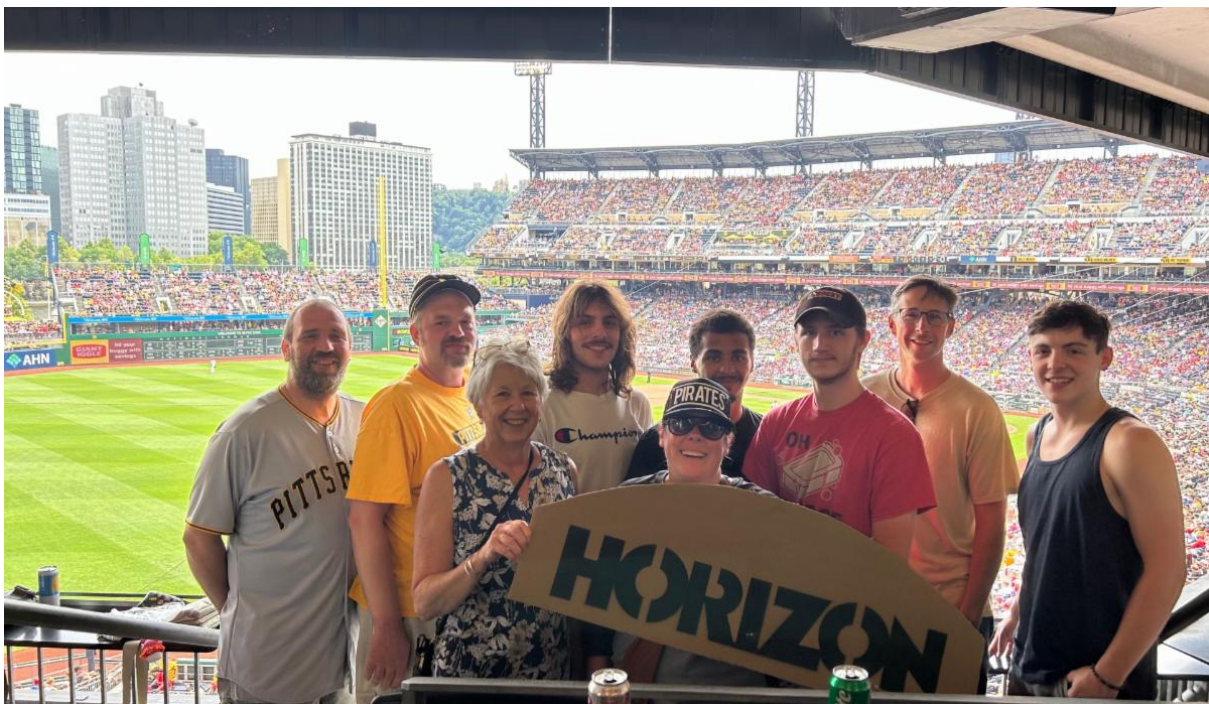
The staff of Horizon Wood Products in the Luxury Suite at PNC Park

Congratulations to Horizon Wood Products of Kersey for winning our "Step up to the Plate" promotional giveaway! We extend our sincere appreciation to all 40 companies who participated in the drawing. Your support allows the Pennsylvania SFI Implementation Committee to carry out all the good work we do across the state. It's through collaborative efforts like these that we can continue to champion sustainable forestry and responsible resource management. Stay tuned for more exciting giveaways and events in the future!