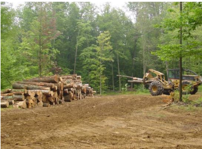
Above is a log landing. From here the logs will be picked up by the log truck.

Landings and roads should be strategically laid out to minimize disturbance and in accordance with topography, property size, and landowner preferences.