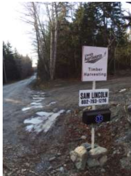
Fig. 1: Logging sign with EMS box.

He put this together after he had a close call, getting pinched while bucking logs on the landing in the middle of a large woodlot on a dead end road with no workers at the job that day. His cell phone was in the loader on the charger. He was able to free himself quickly but laid on the ground a long time thinking about all the "what if's". The experience changed the way he thinks about how he might be better prepared for an accident, particularly for jobs in remote locations unfamiliar to first responders.