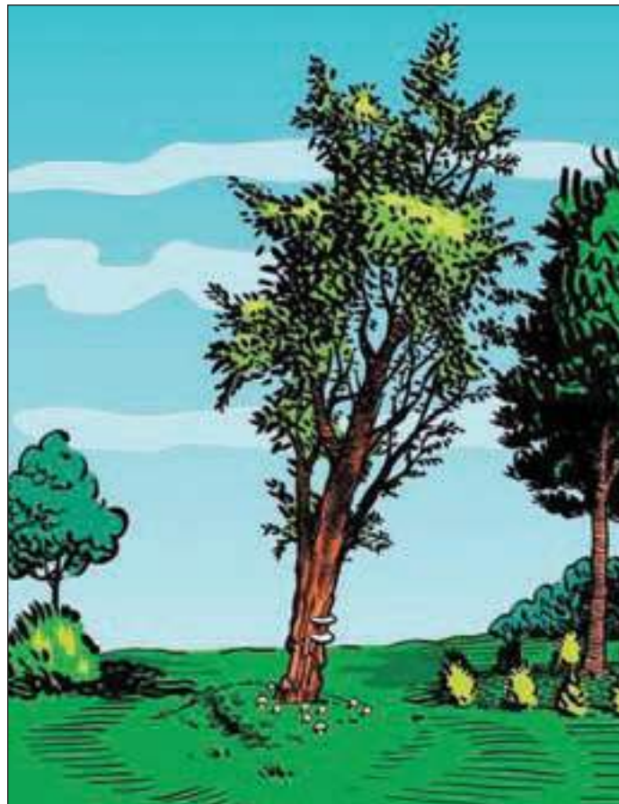
A tree with side lean can be challenging to fell, because tree species with weak wood fiber may not hold the hinge all the way to the ground.

Side lean is often one of the greatest challenges in precision tree felling. The hinge wood is strongest from front to back and weakest from end to end. As a tree falls, the hinge begins weakening, with the tension fibers at the back of the hinge pulling apart, and the fibers at the front of the hinge compressing. Depending on the strength of the wood fibers of a particular species of tree and the amount of side lean, it may be hard for the hinge to work all the way to the ground.