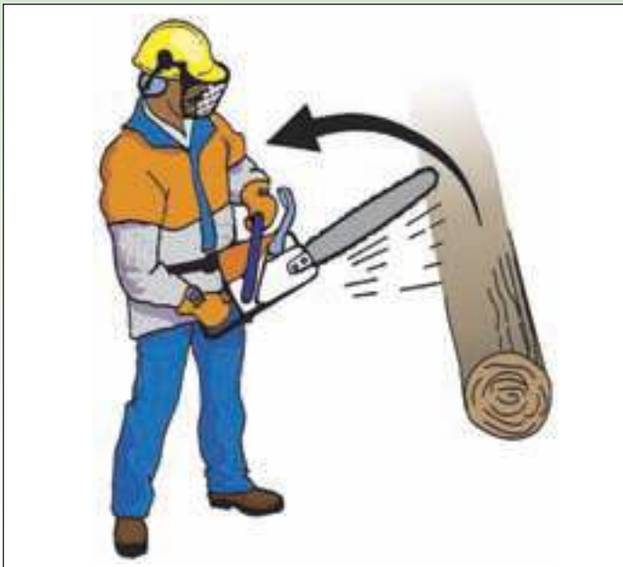
Dangerous kickback occurs when the front, upper corner of the tip of the bar on the chain saw comes in contact with an object.

Straight or back-leaning trees can be finished with a back cut, cutting in from the rear of the tree, as long as there is proper use of