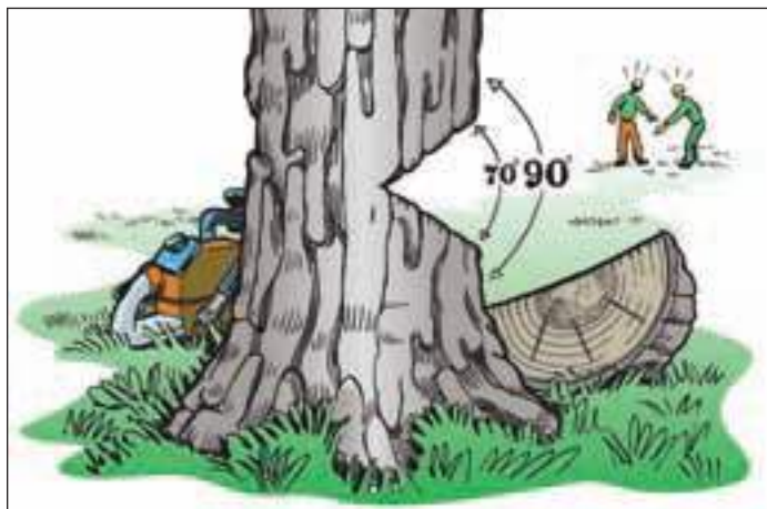
An open-face notch of 70 to 90 degrees provides more control by allowing the hinge to work longer.

This step involves determining which type of face notch to use and how thick and how long to make the hinge. Contrasted with the conventional notch or the Humboldt notch, the open-face notch of 70 degrees or greater gives you more control because it allows the hinge to work longer. Remember, how much you want to open up the face notch will depend on the plan for that given tree. In some situations, such as working on a grade or felling over a sidewalk, it may be desirable to keep the tree attached to the stump when it is