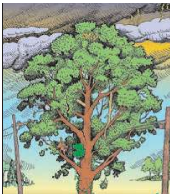
Any tree can pose a variety of hazards for a tree crew, including power lines, deadwood, hangers, decayed wood, vines, and animals.

Another good reason to determine the height of the tree is to establish a danger zone around the tree. Don’t assume the tree will go exactly where you want it. One good rule of thumb is to establish a circular danger zone around the tree